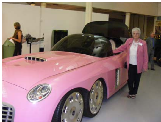
"A guest appearance of "Lady Penelope"

It was fascinating to see so many memorable cars from the early 1900's to the latest prototypes. It was a little disappointing to see so many marque's that are no longer produced. There was one highlight a very early looking car which had a B.M.W. badge it appears that the Austin company gave plans to the B.M.W. company so that they could produce their first car after the World War 1.